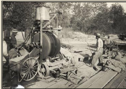
Left Photo: Water company employees mixing concrete. September 24, 1915.