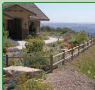
Water-Conserving Landscape Award Winner - 2007

The nomination deadline is Friday, April 25th.