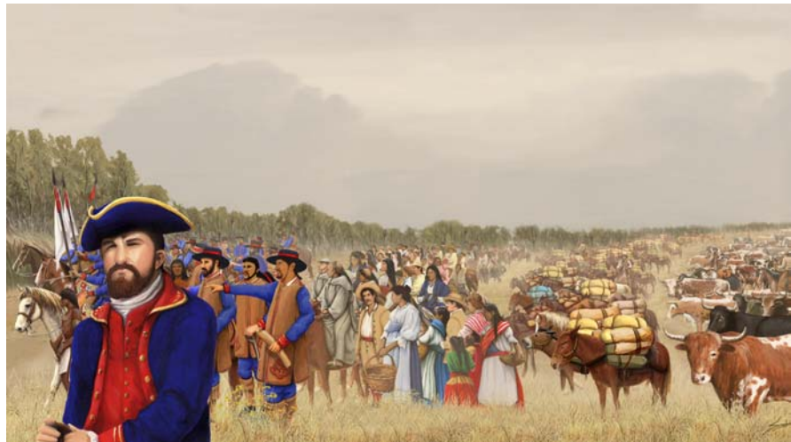
The composition of the Anza expedition with soldiers, families, pack mules, and cattle.