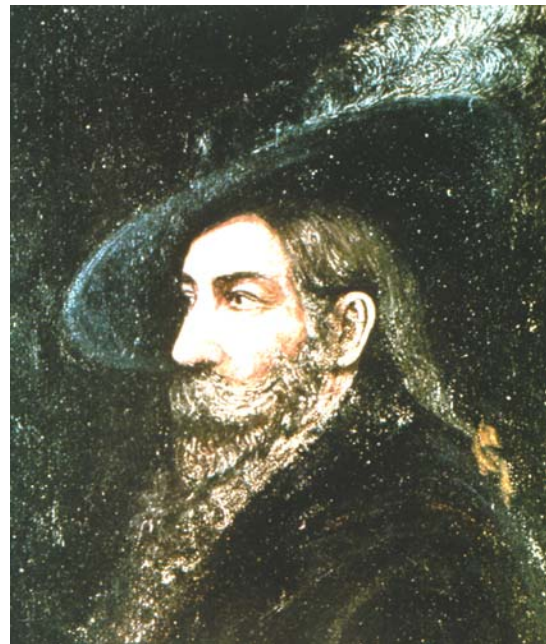
Juan Bautista de Anza from an unsubstantiated French painting