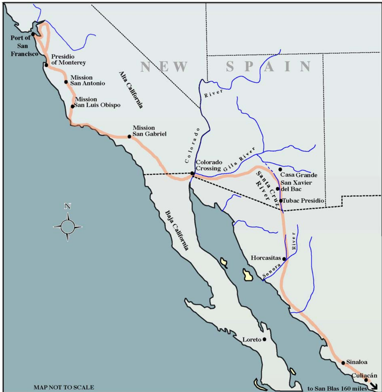
The route of Anza's second expedition (1775-1776) to Alta California .