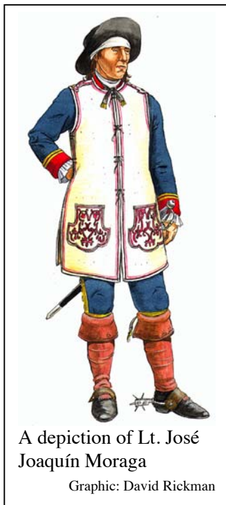
A depiction of Lt. José Joaquín Moraga

As the expedition rested and became acquainted with Monterey, Anza set off to determine the location of the new San Francisco presidio and mission. Joined by Font, Lieutenant José Joaquín Moraga, and a small group of soldiers, they traveled to San Francisco and surveyed the area. He quickly determined the best sites for the presidio and mission and left San Francisco to explore the East Bay. Directed by the Viceroy to determine if there was a river flowing into the bay, they followed the shoreline south to the tip of the bay (now Alviso, north of San José) and then up the eastern shore. Arriving at Carquinez Strait, they continued east along the shoreline, unable to determine whether there was indeed a river flowing into the bay. As his men became increasingly bogged down in the tules, Anza abandoned the quest and headed south, to return to Monterey. From there, Font, Anza and ten of his core soldiers from Tubac, and one dissatisfied couple, made their way back to Mexico along the trail. Anza left Moraga in charge of the expedition.