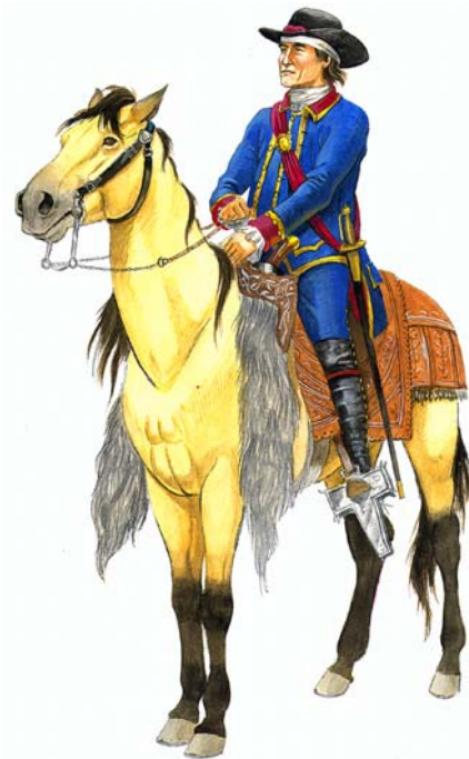
A clean-shaven Juan Bautista de Anza