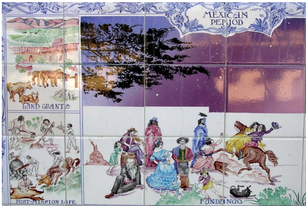
Painted tiles at Monterey's Customs House Plaza near the Pacific House depicting the life of Anza's colonists during the Mexican Period.

Meanwhile, back in Alta California , the presence of those brought to California on the Anza trail radically altered the course of Spanish colonization. Cut off to a large degree from the colonies to the south, the children and grandchildren of Anza's colonists created a unique culture and began to refer to themselves as " Californios ." To this day, many of their descendants still refer to themselves as such. The Juan Baustista de Anza expeditions of 1774 and 1776 not only fundamentally changed the nature of California, they allowed for the founding of San Francisco and San José, and the beginning of eighty years of Spanish Californio Rancho culture.